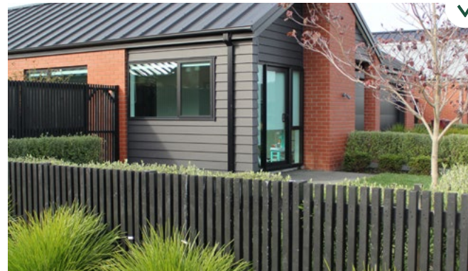
This fence is painted in a dark recessive colour which allows shrubs to stand out.

Stain or paint retaining walls with dark recessive colours such as black or charcoal.