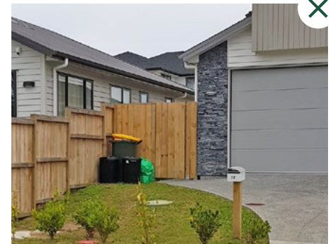
Rubbish bins must be hidden from public view.