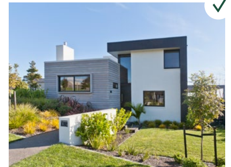
Letterbox incorporated into a blade wall beside the entrance path.