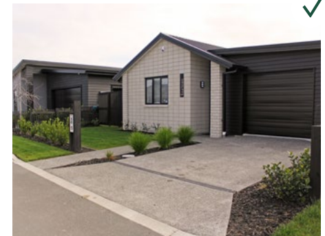
Example of harmony.