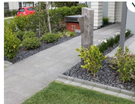
This standalone letterbox has been designed to be integrated with surrounding front yard landscaping.