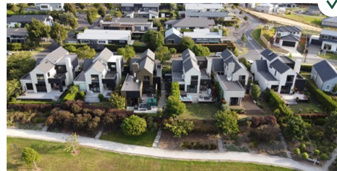
These homes present an attractive elevation to the reserve, overlook the reserve, and connect to the reserve.