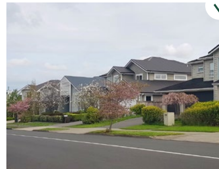
The front yard boundaries of these homes are defined with low height hedging.

There are a wider variety of choices for fencing your side and rear yards. These can be up to 1.8m for privacy. However, there are restrictions for fences alongside reserves and corners.