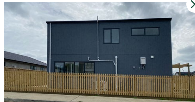
Pipes and accessories are all in a contrasting colour to the side wall of the house, and highly visible from the street.