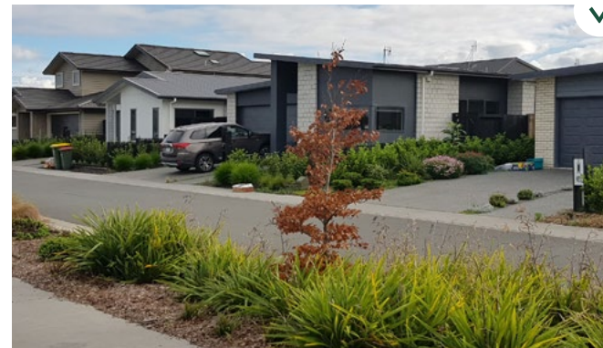
Variation in building form is encouraged in order to create an attractive neighbourhood character.