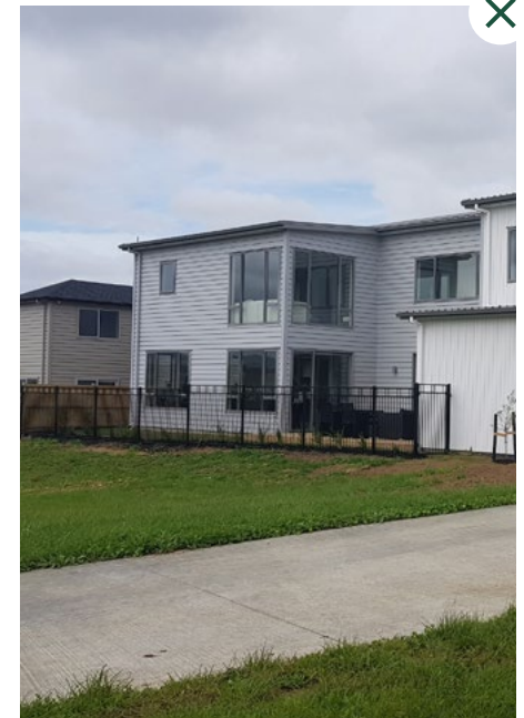
Pool type fencing must be accompanied by planting that has a height of at least 1m.