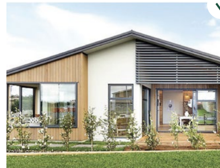
Stained cedar with white panel cladding and charcoal features.