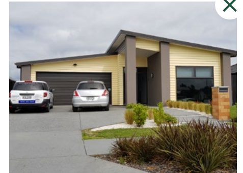
Pastel tints such as this yellow are not encouraged.