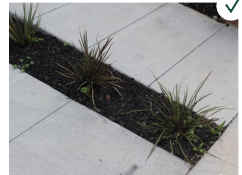
Decorative cuts and planting are encouraged for street appeal and driveway safety.