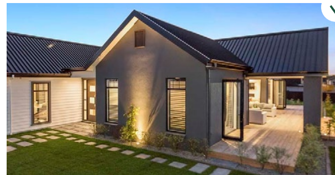
Soft lighting highlights the gabled elevation feature on this home.