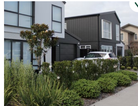
The front yard of this home has been mass planted with plants that offer different textures and heights.

It is encouraged to plant a mix of natives, fruit trees, and plants that support the survival of bees. Consideration should be given to the size of the plant at maturity, and the use of root barriers when planting is close to buildings, structures, or fences.