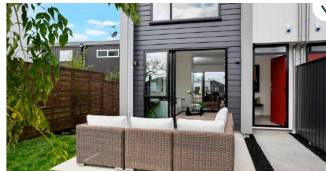
Privacy fencing up to 1.8m is suitable for side and rear yards.