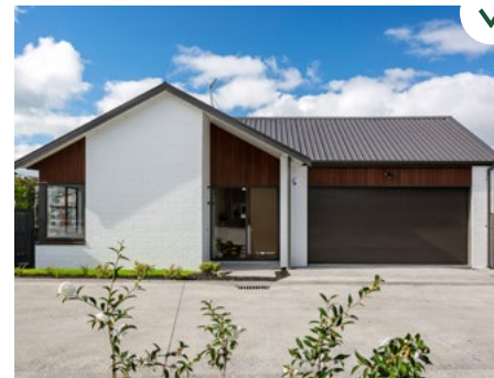
This home has a primary gabled form facing out to the street, and a secondary form (garage) attached.