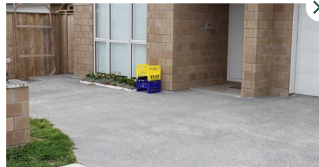
Pathway and driveway are not separated and the driveway is in a different material to the vehicle entry from the streetscape.