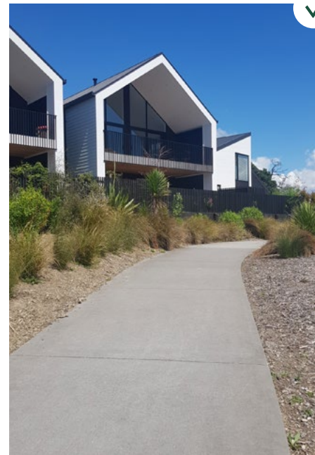
Planting between fencing and the reserve is the dominant feature.