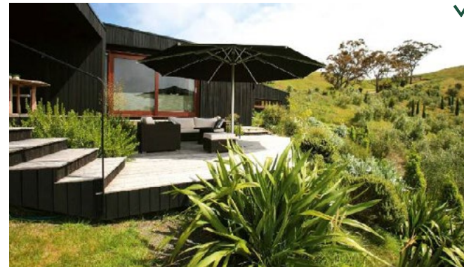
Decking is stepped down from the living room to be at a closer level to the natural ground level.