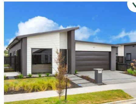
Example of informality and simplicity.

Environmentally friendly features such as water harvesting, efficient heating and lighting sources, and higher levels of insulation are encouraged.