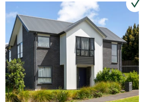
The upper floor of this home has the same footprint as the lower floor.