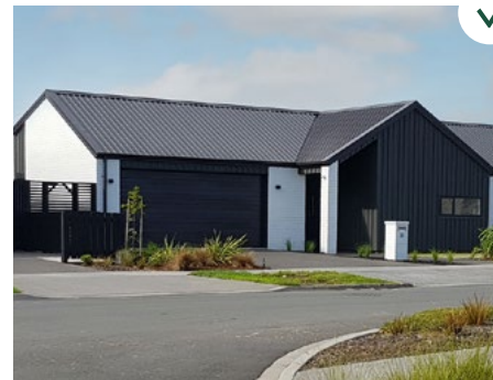
This home does not have any accessories or services visible from the street.

Screening is required in situations where it is not possible to locate services away from the public eye. Screening should be designed to completely conceal services and should complement fencing and the architectural design of the home.