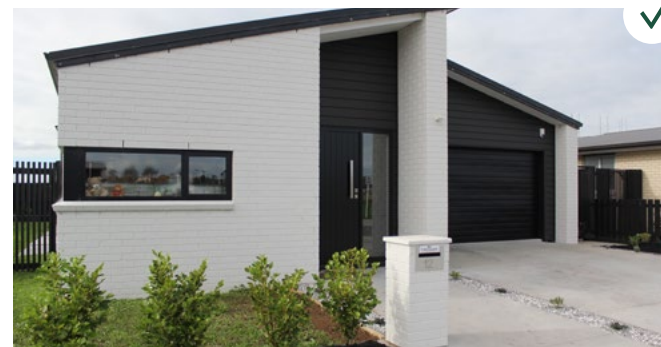
This home has a large window adjacent to the entrance door and a window that overlooks the street from the kitchen.