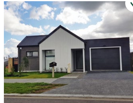
White and charcoal weatherboards with charcoal bricks and mortar.