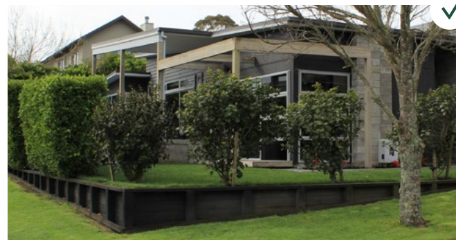
Retaining walls must be stained in a dark recessive colour to allow natural and other built features to stand out.