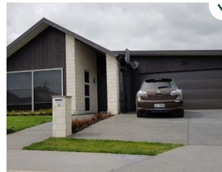
The path and driveway match the streetscape, and are physically separated with planting.

Exposed aggregate Mangatangi Sunset Pebble no oxide, with control joints at 3m centres maximum. Driveway crossings must be constructed to council specifications.