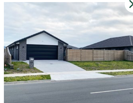
This home only has a garage fronting onto the street. This does not create an engaging street presence.

Private open spaces generally work best if located in the rear or side yards as these locations are usually more private. South facing lots houses can present difficulties in achieving this because of overshadowing. In those cases, consideration should be given to create courtyard houses or street facing private open spaces with adequate privacy screening in the front yard.