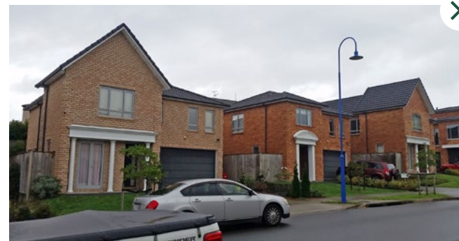
These homes do not have a strong street presence. Small openings, features aren't well considered, and neighbouring homes are too similar in appearance.