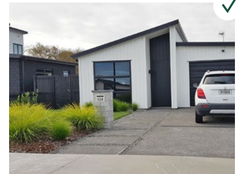
Gates located at the side of this house are painted in a recessive colour to allow the landscaping and architectural features to stand out.