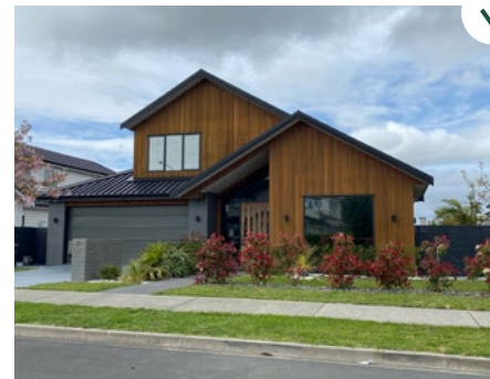
This home has a strong geometrical roof form and its front facade is broken down with changes in materiality and contrast.

The form, colour, and cladding of the building should be considered in conjunction with the buildings planned on neighbouring lots, if any. Buildings should be complimentary to their surrounds and avoid being extremely similar or contrasting.