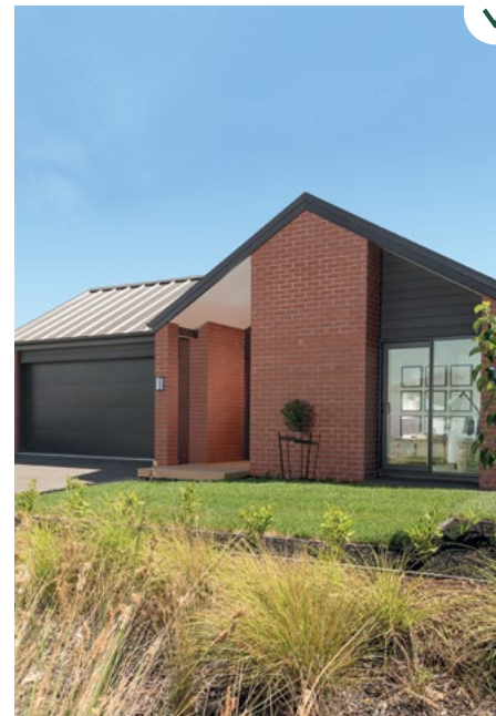
This home has a clearly visible entrance and plenty of glazing looking out the street.

Sites that are bounded by both the street network and a reserve should consider providing two options for pedestrian access into the dwelling. The primary entrance shall be from the street network and secondary access can be provided from the reserve.