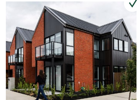
This two storey home has street presence by defining the street, and by having balanced streetscape elevations broken down with large openings