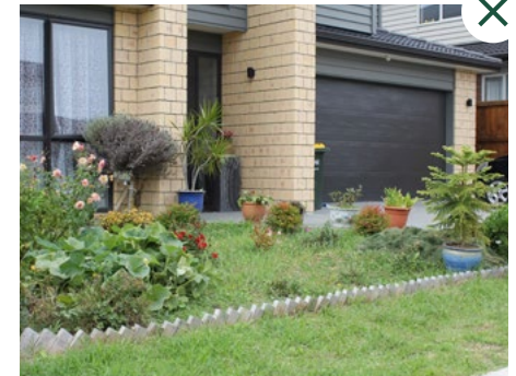
Front yards need to be designed to avoid a haphazard appearance.