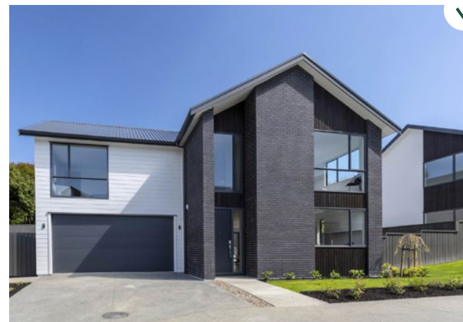
Example of engagement.