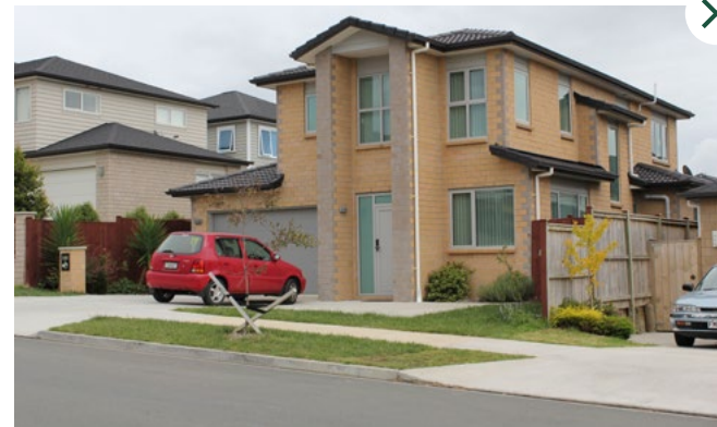
This home has a smaller upper floor footprint in comparison to ground floor and lacks a strong geometric roof form.