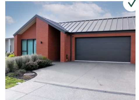
Red brick with charcoal features.