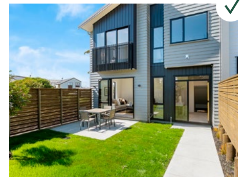
A sunny, private rear yard directly connected to a living room.