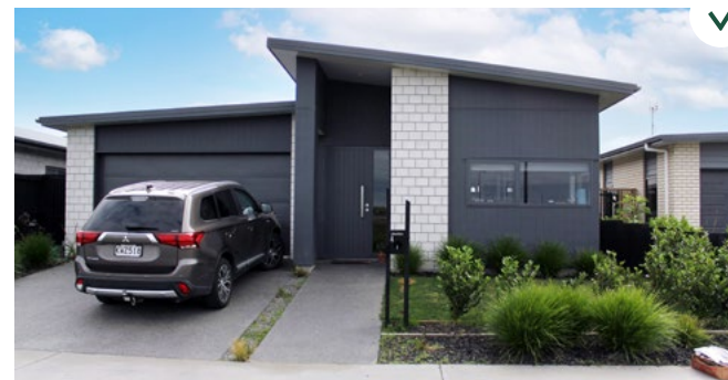
This garage is set back from the face of the building, giving more presence to the entrance and street facing kitchen.